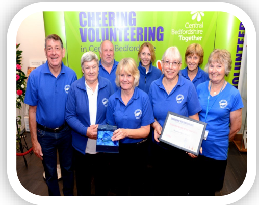
Cheering Volunteering 2016