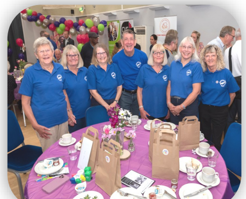
Cheering Volunteering 2022