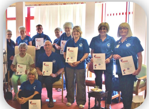
Volunteers' Lunch 2018