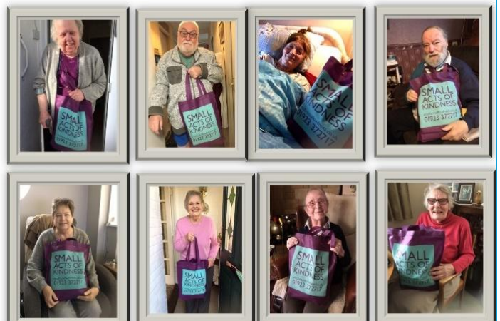
Sixty residents received a Warm in Winter Bag, donated by Small Acts of Kindness

Volunteers also collected food parcels on 84 occasions from the Dunstable Food Banks for households unable to get to the Food Bank themselves.