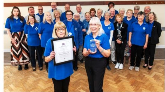
Presentation of the King's Award for Voluntary Service, 18 April 2024

13 th Annual General Meeting 19 February 2025 7 p.m. Council Chamber Houghton Regis Town Council